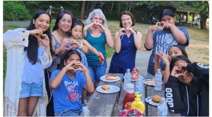
“Every day we are together is a best day”